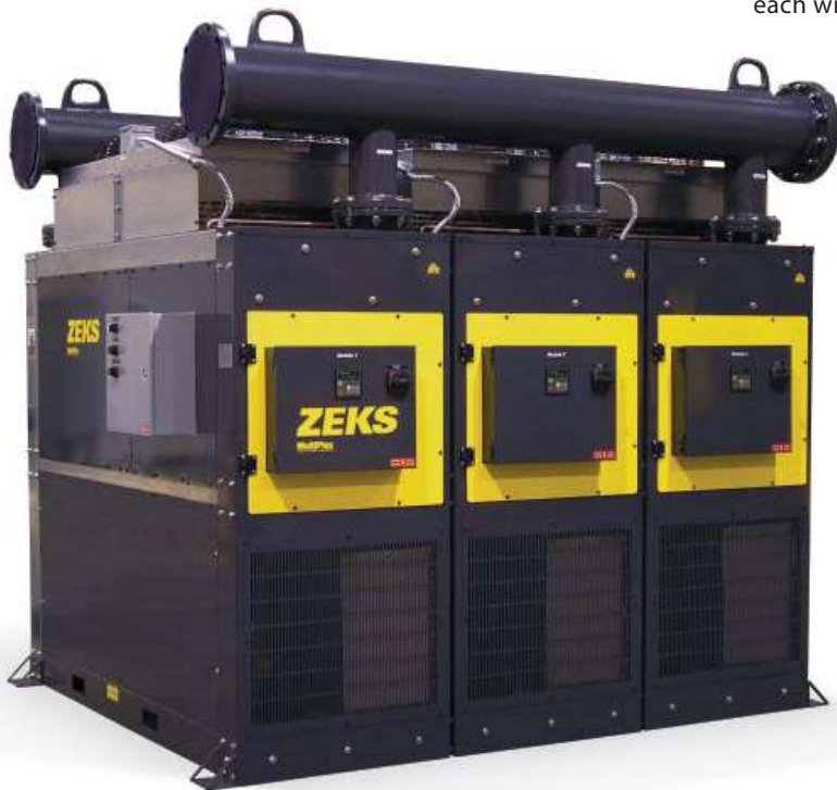
3-Module 7200HSFMA MultiPlex™ model with air-cooled refrigeration condensers and NEMA 1 electrical arrangement

The design enables users to maintain dryer operation even when one of the independent refrigeration systems is taken off-line for service or maintenance. Properly sized, the dryer outlet pressure dew point will not be compromised if a single module is de-energized.