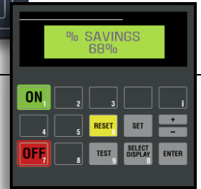
DPC™ - Standard on 1000-2400, optional on 150