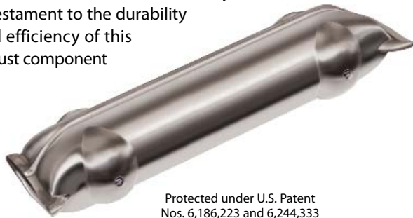
Protected under U.S. Patent Nos. 6,186,223 and 6,244,333