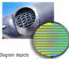
Diagram depicts exchanger cross section

Protected under U.S. Patent Nos. 6,186,223 and 6,244,333