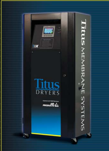
TDD & TDX Series Compressed Air Dryers