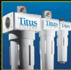
THF Series Compressed Air Filters