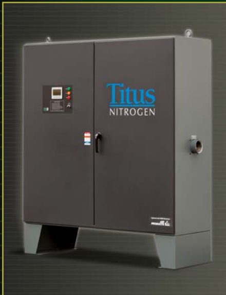
TN2 Series Nitrogen Generators