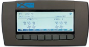
Semigraphic user interface with multifunctional buttons and dynamic display icons.