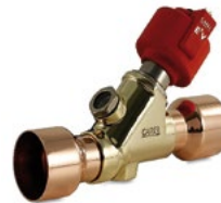
The electronic expansion valve allows an improvement of performance.