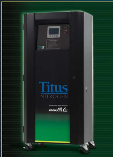
TNX Series Expandable Nitrogen Generators

Ask Us About These Other Great Products from Titus: