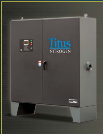
TN2 Series Nitrogen Generators