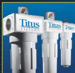
THF Series Compressed Air Filters